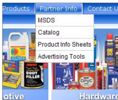
The Partner Info section allows you to easily download MSDS, Catalogs, Product Info Sheets and Advertising Tools such as ABRO logos.

Together we can stop the counterfeiters.