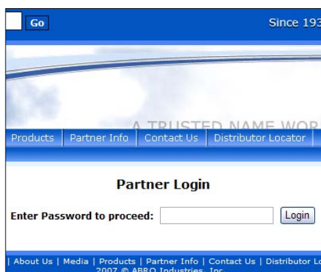
To protect ABRO from counterfeiters, the partner info is password protected. Please contact your sales representative to receive your password.