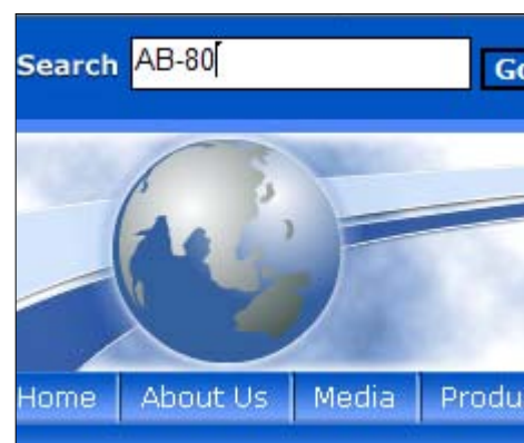
Are you searching for an ABRO product? Now you can locate it by entering either the part number or the product name into the SEARCH field.