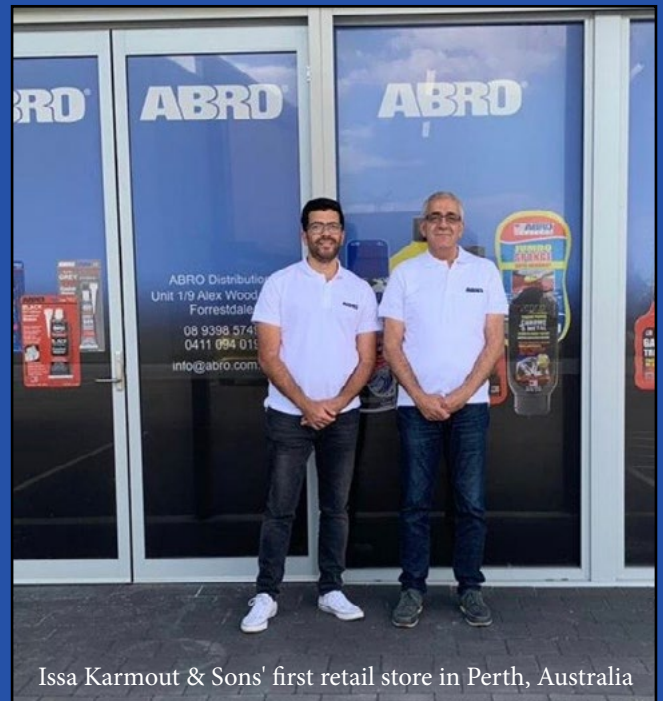
Issa Karmout & Sons' first retail store in Perth, Australia