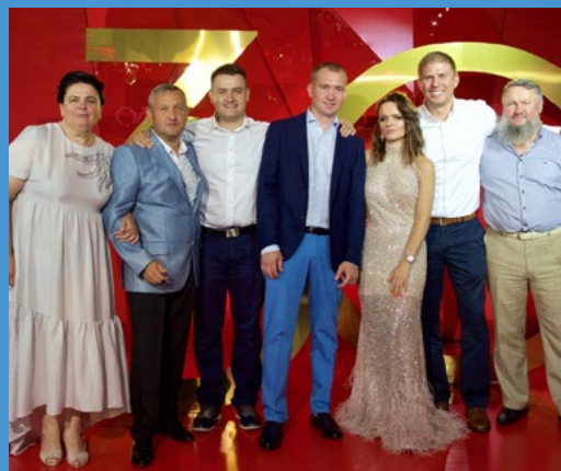
Long time business partners and friends - Omaks and ABRO.