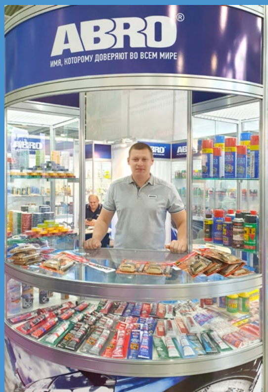
ABRO products displayed at the ABRO booth in Moscow.

This September, the Omaks team participated in a Moscow trade show called "Interauto". There were more than 400 exhibitors from 20 countries. A wider range of products attracted business people from the auto industry at the ABRO booth. ABRO was well represented and promising new leads were established.