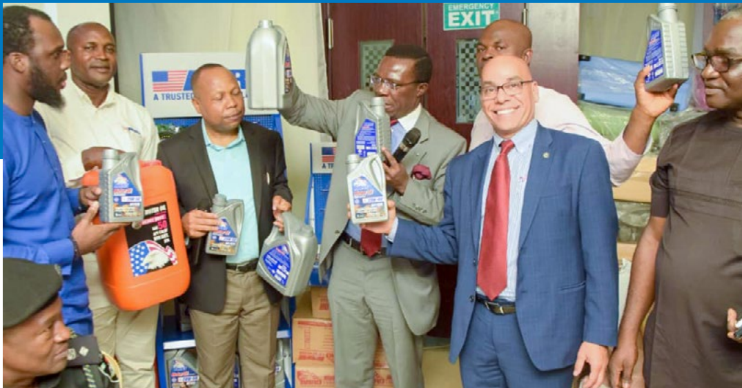
The new lubricant line was well received by the local customers and sales teams.